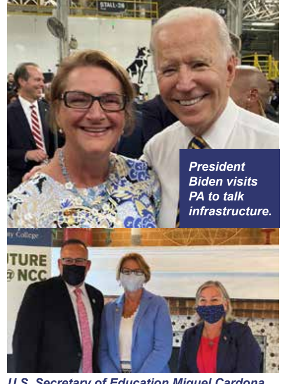
U.S. Secretary of Education Miguel Cardona visits PA to discuss education with Rep. Madden and US Congresswoman Susan Wild (D-7th District).

Community drug stores continue to provide vaccines. Check their websites for vaccination schedules.